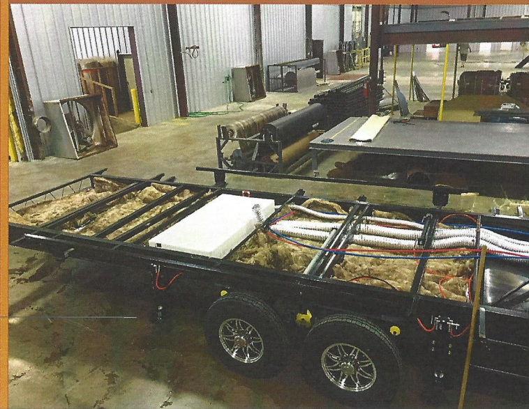
FLOOR INSULATED WITH ASTRO-FOIL & BATT INSULATION